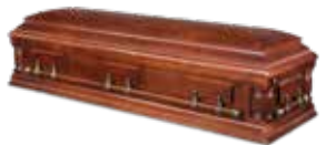
Ashby Poplar 54-55