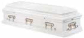
Heavenly White 50-51